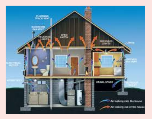
This photo shows areas where air enters and escapes homes

Heating and cooling buildings requires energy! Poor design, lack of insulation and drafts can all cause buildings to become too cool or too warm, often resulting in higher energy use. Thankfully, there are ways to minimize heat loss in buildings and improve energy efficiency! How does your school measure up?