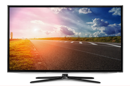
Video game consoles, microwaves, and TVs are common vampire power draining appliances. Can you think of any others?