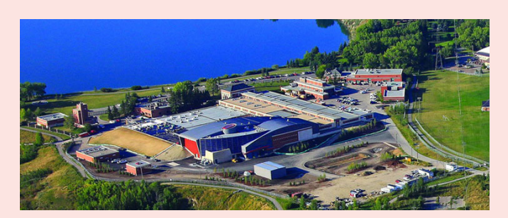
The Glenmore Water Treatment plant treats drinking water for people living in the south part of Calgary. Where does drinking water come from in your community, and where and how is it treated?

While it may seem like there is an endless supply of water at school, it takes energy to transport, treat, heat and store water. Every time a toilet is flushed, a sink is turned on, or the drinking fountain is used, water enters a municipal water treatment system and undergoes processes that require energy. Water consumption makes up a component of our environmental footprint. How much water do you think gets used at your school every day?