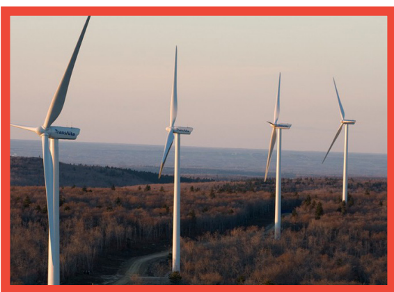
Wind turbines.

We can make energy from renewable resources like solar and wind, but what about when the wind isn't blowing or the sun isn't shining? In peak times, unused electricity can be stored to use when needed. Batteries are one way to store excess electrical energy as chemical potential energy, which can then be converted back into electrical energy when it is needed.