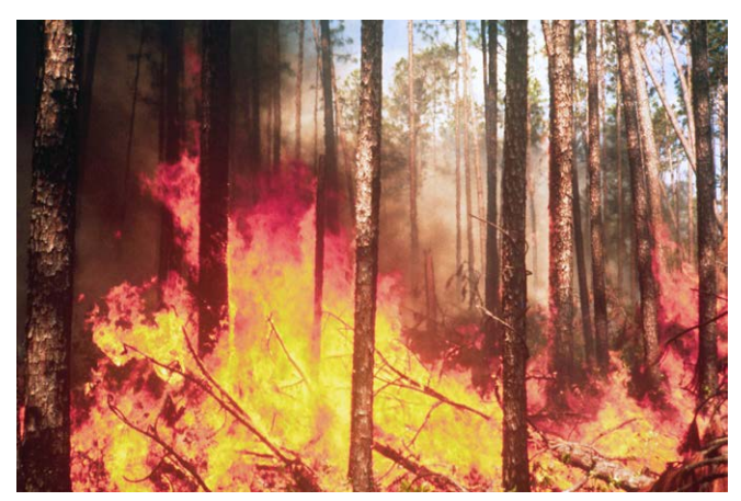
Part of the natural forest cycle, fire destroys old, vulnerable trees....

Each year about 60% of the forest fires that burn Alberta's forests are caused by nature such as lightning hitting trees. Humans, usually acting irresponsibly, cause the other 40%. People have been