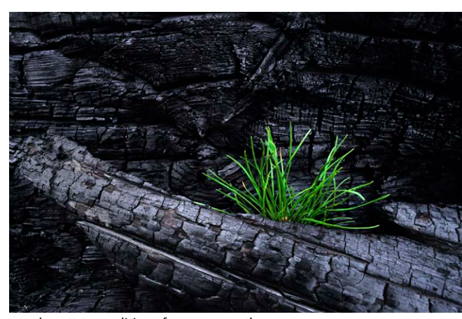
...and creates conditions for new growth.

working very hard for many years to prevent humancaused forest fires. When forest fires begin, the Government of Alberta springs into action, investing time and effort into fighting forest fires as quickly as possible. There are even people whose job it is to watch the forest. From the towers where they live they keep their eye on the forest. Any sign of natural or human-caused forest fire is reported immediately, and an attack force goes to work.