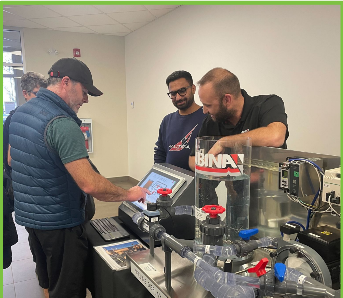
Pipeline Demonstration at Pembina Pipeline