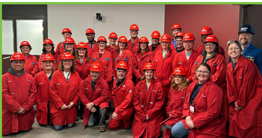
CanmetENERGY Research Center Tour

Through hands-on learning experiences and thoughtful discussions, participants deepened their understanding of Alberta’s energy sector and explored practical ways to bring current, relevant energy and career education into their classrooms. We are pleased to share the outcomes and impacts of this professional development experience in this report.