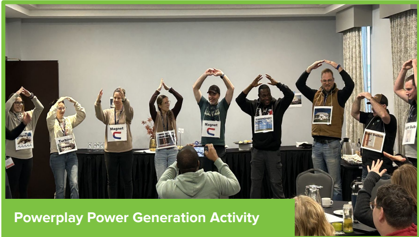
Powerplay Power Generation Activity