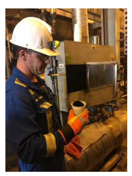
A Cenovus employee shows a sample of newly unearthed oilsand slurry.

Inside Education created a shared Google Folder for participants to access in in order to build upon ideas, and discussions. All speaker presentations, as well as the classroom activities and resources mentioned through the program, were readily made available to participants. The participants also have access to a Google Doc that serves not only as a list of resources, granting organizations, and websites, but has also become a place for delegates to share ideas or ask questions of each other.