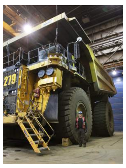
A Suncor employee stands next to an oilsands truck for scale.