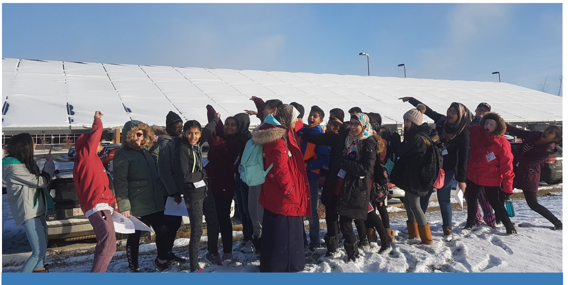
Students are energized by solar electricity production - and many other experiences at S3 2017