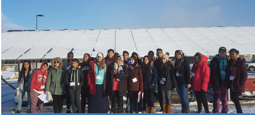
Ecole McTavish and Fort McMurray Composite High School explore the solar panels at the RMWB South Operations Centre.

S3 2017 participants discover sustainability around the RMWB.