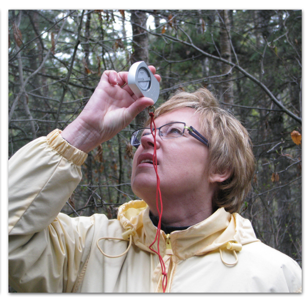
October 1-3, 2015 Whitecourt, Alberta

Inside Education's 2015 Boreal Education Program was a hands-on learning opportunity to support teachers in bringing current, relevant and meaningful natural resource education to their classrooms.