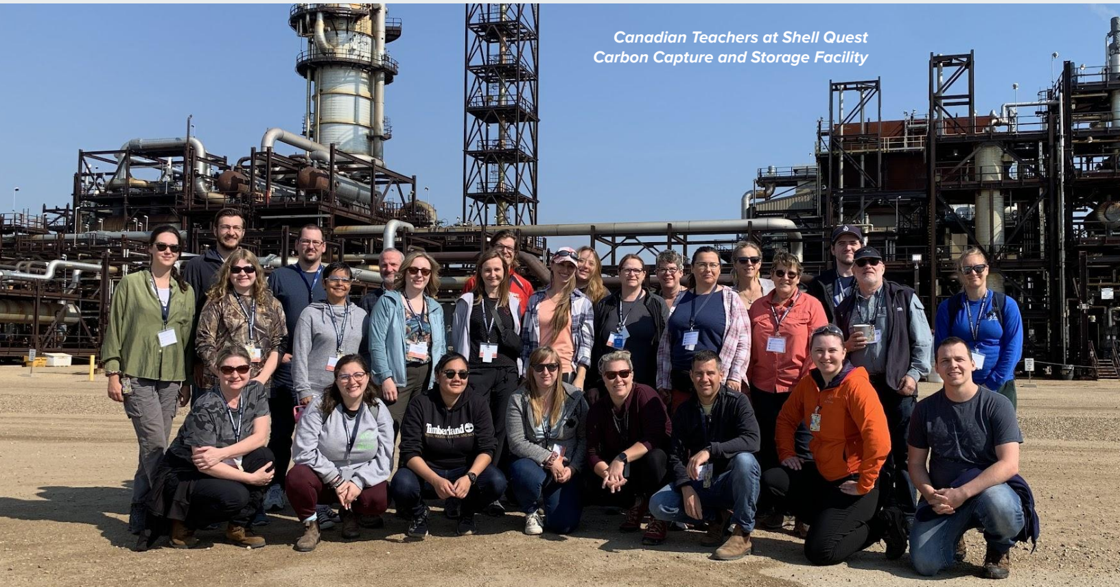
Canadian Teachers at Shell Quest Carbon Capture and Storage Facility

A five-day immersive exploration of energy development and an in-depth look into the future of energy innovations and technologies and ideas to integrate energy education into classrooms across Canada.