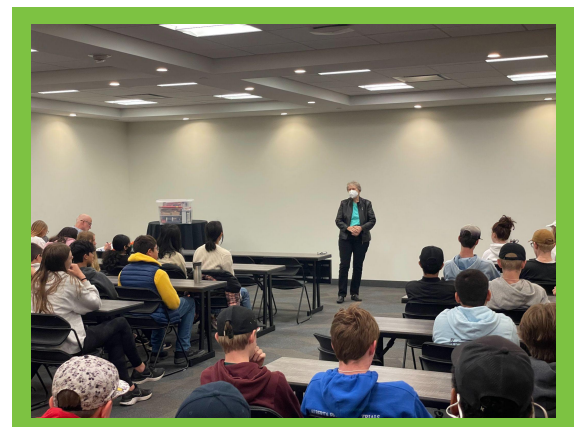
Dr. Roberta Bondar

As an extension of Regional Generate, Inside Education was given the opportunity to bring a group of 52 students to the ISA (Instrumentation, Systems & Automation) Conference in Calgary for a private session with Dr. Roberta Bondar. Dr. Roberta Bondar was first Canadian woman and first neurologist in space, and is currently an active photographer and environmental advocate.