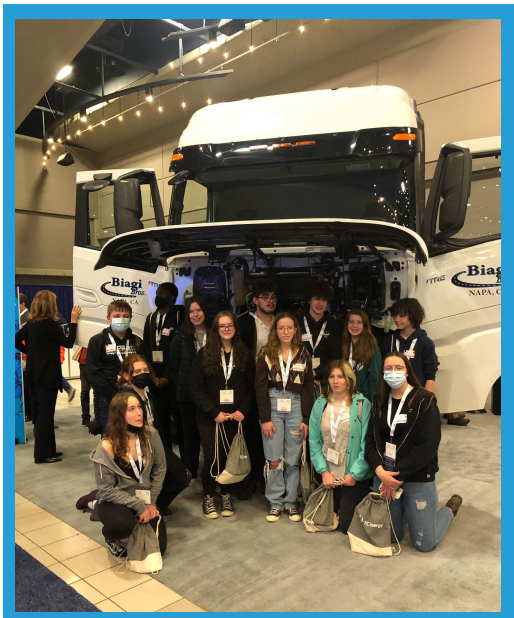
Canadian Hydrogen Convention

The program began at NAIT where they toured the Renewable & Alternative Energy Lab and used PetroLMI's Virtual Reality headsets to learn more about careers in the energy sector. These experiences were valuable because they gave the students a look at the variety of resources used for energy across Alberta - including oil, gas, wind, solar and biomass. Most of the day was spent at the Canadian Hydrogen Convention. The Canadian Hydrogen Convention was the first of its kind, and we were very fortunate have the opportunity to attend. First, the students heard from panelists that spanned the emerging hydrogen sector. Then, the students toured the exhibition hall, hearing first hand about the many applications of hydrogen - including air travel, road transport, heating and electricity. The day ended with a presentation from EcoSchools Canada and a workshop designed to encourage students to take what they learned back to their schools and communities and kickstart an action project.