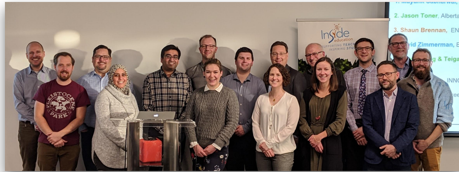
Our "Expert Circuit" guests

We extend deep thanks to our program partners for their laudable support of E3 2018. Teachers and students alike voiced their appreciation for making the program such an accessible opportunity.