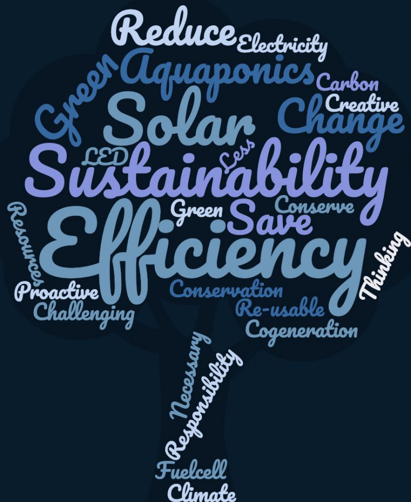
Top three associated words when you hear "energy efficiency"