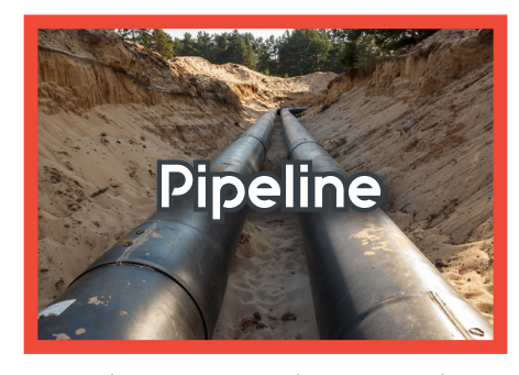
A pipeline carries oil or natural gas.

There are many steps involved in producing energy including consultations, environmental assessments, resource extraction, transportation, reclamation and processing. We must consider the environment, society and economy every step of the way!