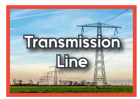
A transmission line carries electricity