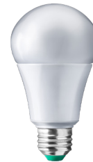
Light emitting diode (LED)