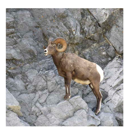
Rocky Mountain big horn sheep

People that depend on the land for their livelihood may be affected, as well. Whether it's farmers in our grasslands; companies producing lumber in Alberta; or trappers depending on their traplines, Albertans have always lived from the land. Although change is natural, living organisms require time to adapt. A changing landscape resulting from a rapidly changing climate will impact us all.