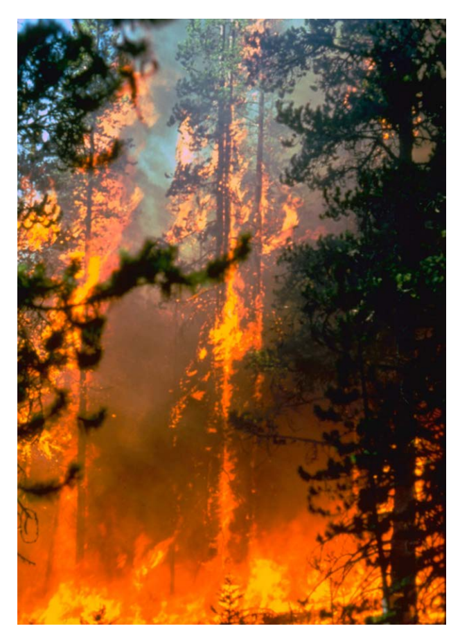
Climate change may increase how often and how severely forest fires will occur.