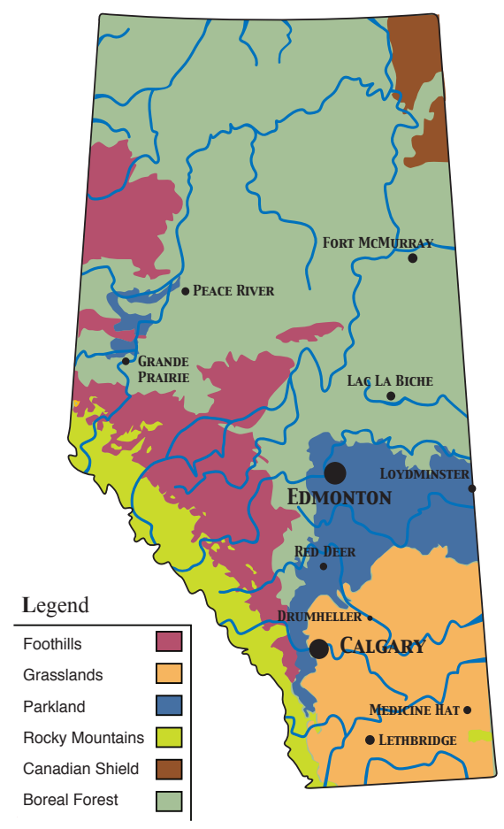
\label{lem:Alberta's natural regions.} Alberta's \ natural \ regions. Climate change may affect the the look of Alberta's landscape.

Sounds pretty good, right? Not so cold in the winter, warmer weather in the summer... what could be wrong with that? For our ecosystems, there is a lot wrong with that. The soil and moisture conditions in these regions are best for growing the plants that are already found there, not plants growing further south. Local wildlife nay not be able to adapt to these change and we risk losing biodiversity.