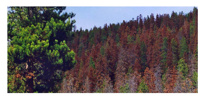
Millions of trees have already been killed by the mountain pine beetle and millions more are vulnerable.

Forest scientists, foresters and land managers are very concerned that insects like mountain pine beetle can and will do serious damage. Millions of trees are already affected and millions more are vulnerable.